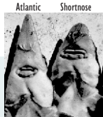
Snouts and mouths

Snout much shorter and less tapered; mouth is wider (> 60% of body width); skin smooth and slippery; 19-22 anal fin rays and 19-22 dorsal fin rays; usually shorter than 1 m; often occurring in the same river habitat, although this species is rarely observed in the sea.