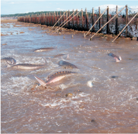
Atlantic Sturgeons just outside a weir in the Bay of Fundy