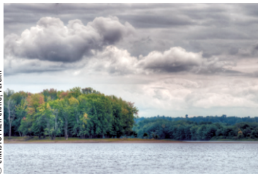
Lower Saint John River